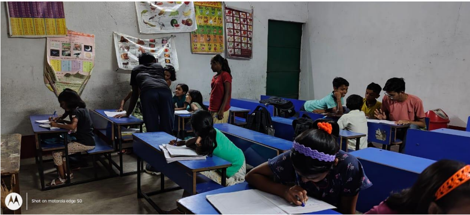
5. Gandhi Jayanti at Sankalp vidyalaya mohangiri Kalahandi was celebrated on 2 nd October 2024.